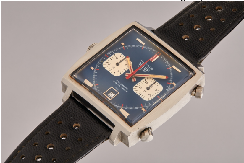
Heuer Monaco, Reference 1133. Circa 1969 Estimate On Request

To be Sold in RACING PULSE , the Flagship New York Watch Auction, on 12 December