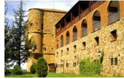
Parador de BENAVENTE