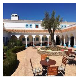
Herdade dos GROUS