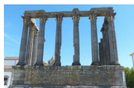
Temple Romain EVORA