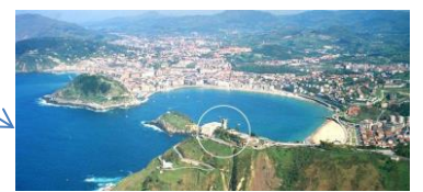
Arrivée San Sébastian hôtel Monte Igueldo