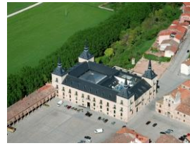
Parador de LARMA