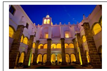
Covento do ESPINHEIRO