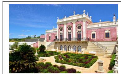
Départ Palacio do ESTOI